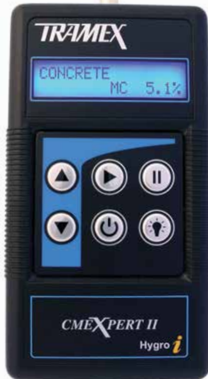
Product order code: CMEX2