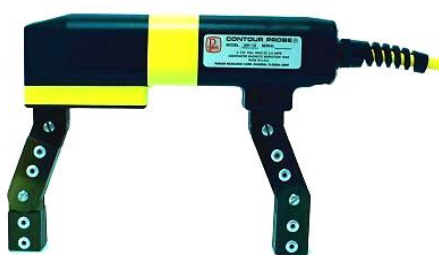
Figure 1: UW-12 / UW-115

DESCRIPTION: The Parker underwater Contour Probes are electromagnets capable of inducing a strong magnetic field in ferromagnetic materials for the purpose of performing Magnetic Particle Inspections. The UW-115 produces an A.C. magnetic field from a GFI protected 115 VAC power source. The UW-12 produces a D.C. magnetic field from a 12V battery or 12 VDC power supply.