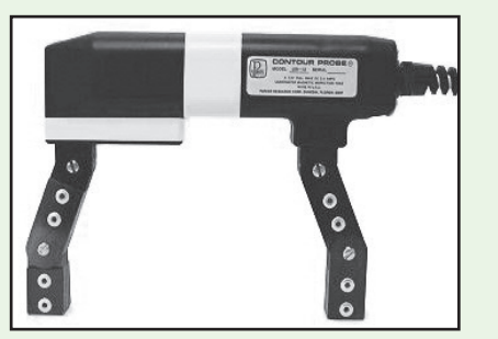
UW115 & UW12 Underwater A.C. and D.C. Yokes.