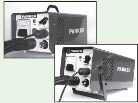
DA750 & DA1500 - Portable Mag units. Heavy duty 750 or 1500 AMP. Available with all accessories.