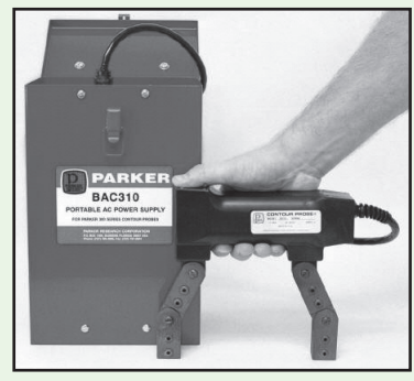
BAC310 - Portable, Stand alone Battery Inverted 115VAC Power Supply. Operate A.C. Yokes or other Instruments where normal power sources are unavailable.