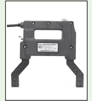
DA400 - Contour Probe. Most popular A.C./D.C. Yoke. Available in various Kit forms. Y400 Yoke Light additional.