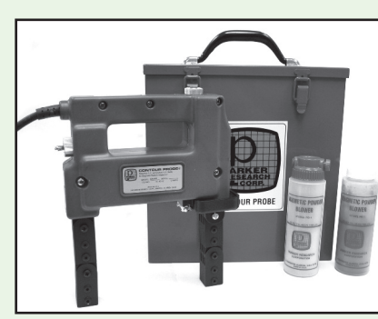
DA-400 Shown With "A" Kit items. Kit items are available with dry powder and Wet Fluorescent inspection mediums. Including Black Light and Steel Carrying Case.