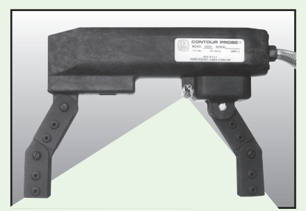
B300 - A.C. Contour Probe. Available with Y300 Yoke Light. Also available with GFI Plug.