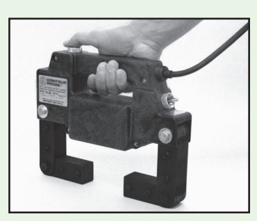
A210 - Heavy Duty A.C. Contour Probe. Strongest A.C. Field Yoke available. Model DA200 available for A.C./D.C. Operation.