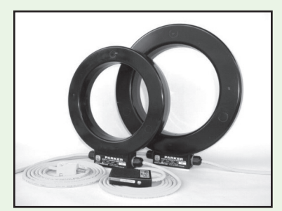
PL8 & PL10 - Magnetizing Coils. 8" & 10" I.D. Complete with Carrying Case.