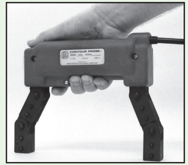
B100 - Our most economical A.C. Contour Probe. Available in 115VAC and 230VAC. May be ordered with the Y400 Yoke Light at extra cost.