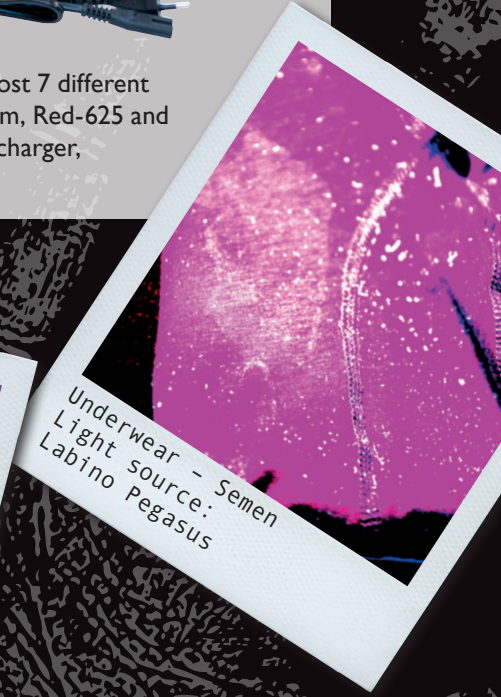
Underwear - Semen Light source: Labino Pegasus