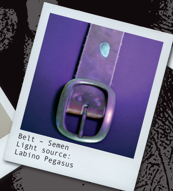
Belt - Semen Light source: Labino Pegasus