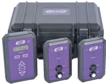
APOLLO 3.0 DOUBLE KIT (PN: M514)