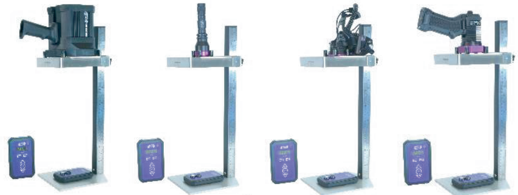
BB 2.0 Series (UV Handheld)