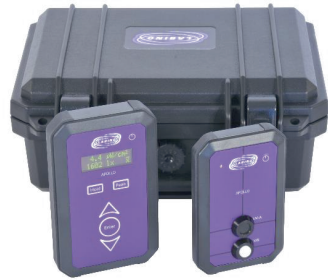
APOLLO 3.0 SINGLE KIT (PN: M513)

Our Apollo 3.0 dual meter calibration services are now offered in 10 LOCATIONS WORLDWIDE . These centers are in Chicago (USA), Houston (USA), Edmonton (CANADA), Stockholm (SWEDEN), Bilbao (SPAIN), St. Etienne de Tulmont (FRANCE), Milan (ITALY), Hinckley (U.K), Sydney (AUSTRALIA) and Kaohsiung (TAIWAN). All follow a specific calibration process proprietary to Labino and all have the same equipment.