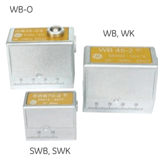
Types WB/WK and SWB/SWK