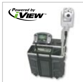
CA-ZOOM® PTZ Series High-power zoom (up to 300:1) with joystick-controlled color pan-tilt-zoom camera and color VGA display