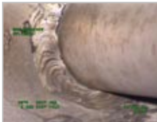
▼ Pharmaceutical Tank Weld Inspection