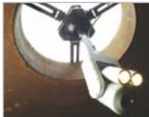
▼ Oil Refinery Vessel Inspection