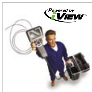
VideoProbe® XL PRO™ Advanced portable, high-resolution, digital video borescopes with measurement