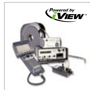
LongSteer® VideoProbe® Up to 100 ft long, articulating, small-diameter video borescopes