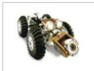
ROVVER® Steerable robotic crawlers