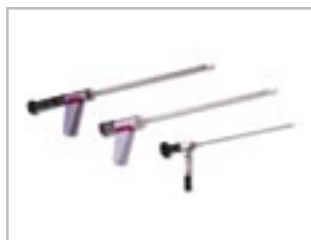
Rigid Borescopes Durable insertion tubes with superior image quality