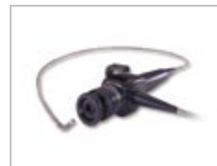
Flexible Fiberscopes High-resolution images. Available in many diameters