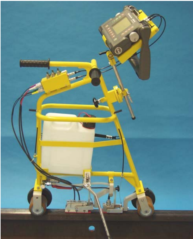
Fig. 1: Rail testing trolley SPG 2