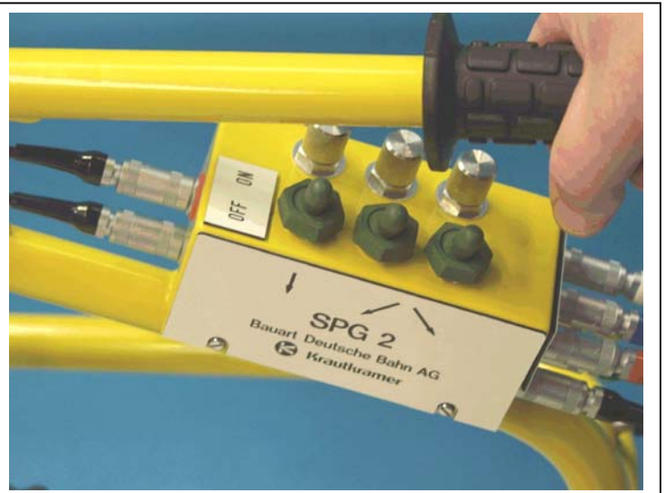
Fig. 4: The distribution box of the SPG 2