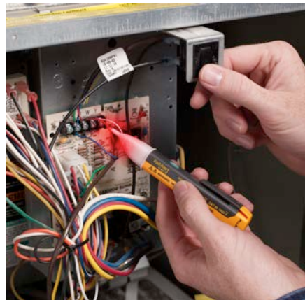
Low volt version