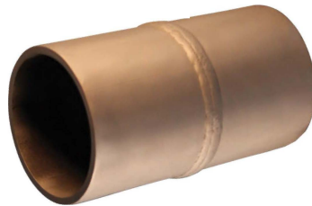
WELDED PIPING 4" SCH40 (0.25" T) x 8" MT/PT #P008 VT #P208