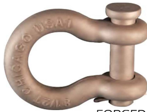
FORGED SHACKLE & PIN 4.25" with 0.75" pin MT/PT #P005 VT #P205