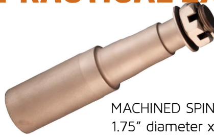
MACHINED SPINDLE 1.75" diameter x 8" MT/PT #P002 VT #P202