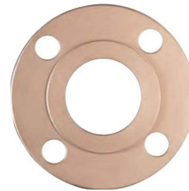
FORGED PIPE FLANGE 6" OD x 0.75" thick MT/PT #P009 VT #P209