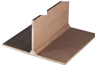
WELDED TEE 0.25" x 8" x 8" x 4" MT/PT #P011 VT #P211