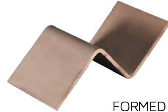
FORMED METAL PLATE 0.25" x 4" MT/PT #P006 VT #P206