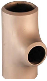
CAST FITTING 2.0" to 1.3" reducer, 5" long MT/PT #P001 VT #P201