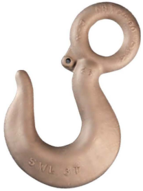
FORGED EYE HOOK 6" long with 2" eye MT/PT #P004 VT #P204