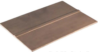
WELDED PLATE 0.25"x8"x12" MT/PT #P007 VT #P207