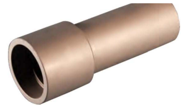
PIPE to SOCKET WELD 2" SCH160 PIPE to COUPLING MT/PT #P012 VT #P212

PRACTICAL EXAM SPECIMEN DETAILS: • Standard tolerance (+/-) 0.150" (4mm) • Custom specimens available