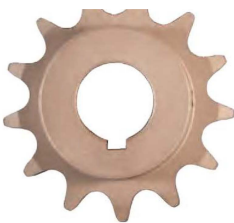
MACHINED GEAR 4.6" diameter x 1.5" bore MT/PT #P010 VT #P210