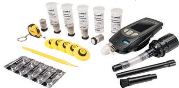
PosiTector CMM IS Pro Kit includes the PosiTector DPM Advanced

Replacement chambers, salt solutions, tools, caps, stackable probe extensions, and fins are available upon request