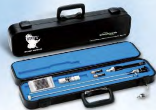
Hawkeye Classic Kit

A Mini Maglite® flashlight is supplied with every Hawkeye borescope. Higher intensity light sources like the Super-NOVA™ Light and the Luxxor 24 Light (shown on the reverse) are also available.